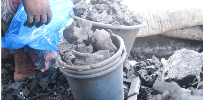
Photo 2: A charcoal saleswoman packing one bag of a 500 CFA franc worth. This is enough to prepare a couple of meals.

Crédit: Marine Scandella, December 2022, Yopougon, Sipores market